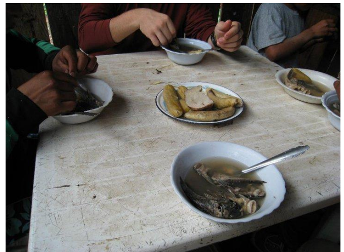
Fish soup, plantain, and popa china for breakfast