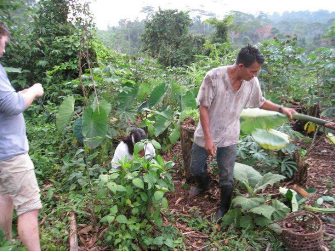
Harvesting popa china from their garden