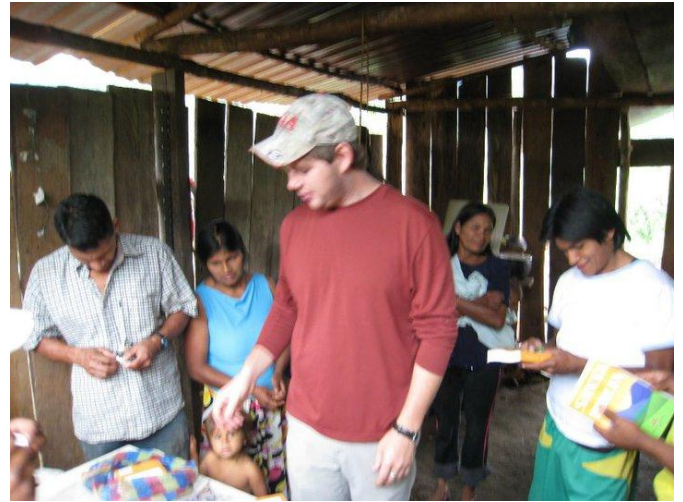
Handing out reading glasses and Bibles to villagers