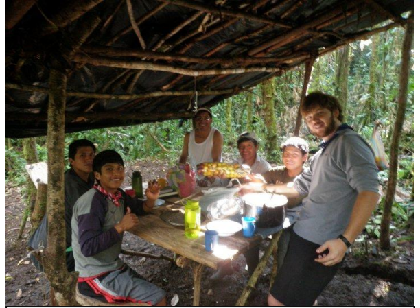
Our Kitchen Table