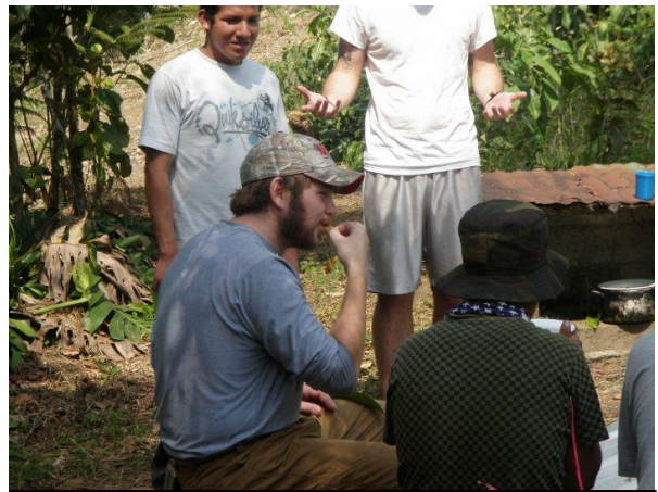
Eating Worms... Yuck!