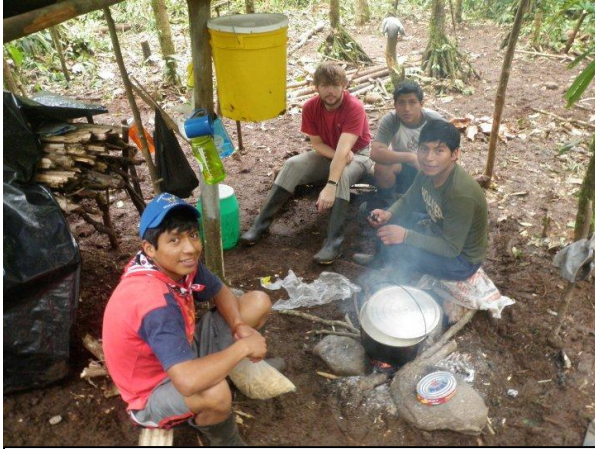
Cooking at Camp