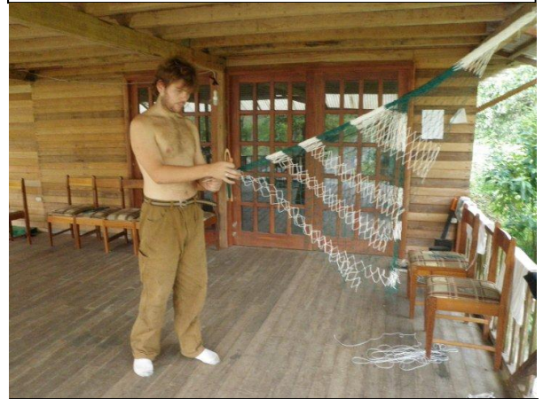
Making a Hammock