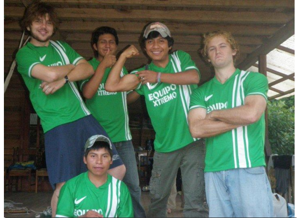
Proud Xtreme Team Graduates